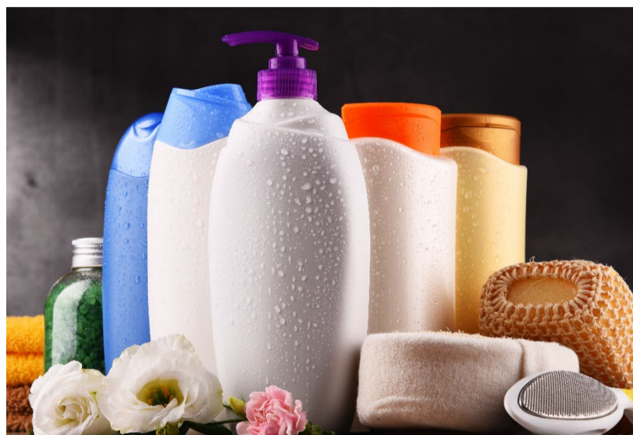
It's good to know whether your toiletries, cosmetics, and household cleaning products contain potentially harmful substances

Your bathroom may well contain not just lindane and mercury, but a veritable cocktail of other potentially hazardous ingredients including nonylphenol ethoxylates, benzene, formaldehyde, chloroform, toluene, plus microbeads and nanomaterials in toiletries which end up as pollution in our oceans.