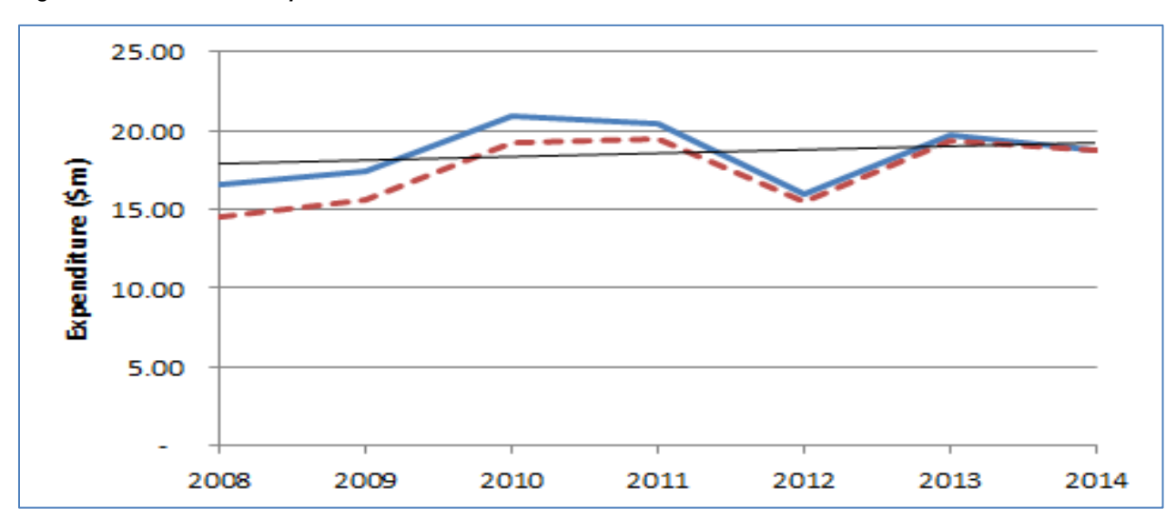
Figure 16: Trend in overall expenditure on the BRS Conventions

Note : The dotted line shows the nominal cash amounts, while the solid line shows real-terms amounts adjusted for inflation. See the description of methodology at Annex 2 for details